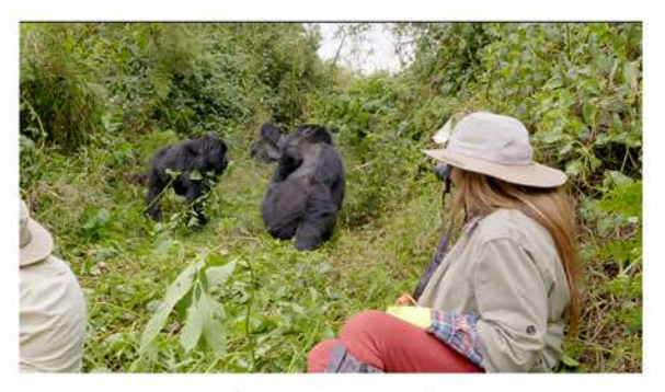
EP 8 | Rwanda | 3:39