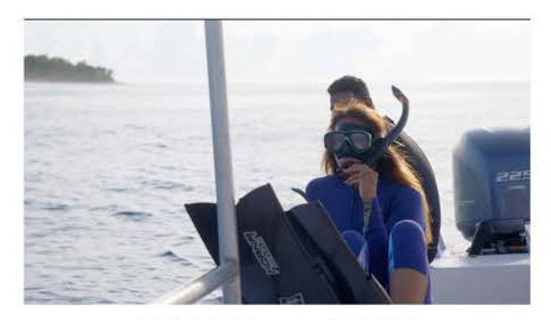
EP1 | Tonga | 4:27