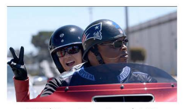
EP2 | San Francisco | 4:33