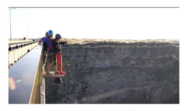
EP3 | Idaho | 6:11