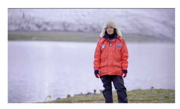
EP 6 | Antartica | 6:43