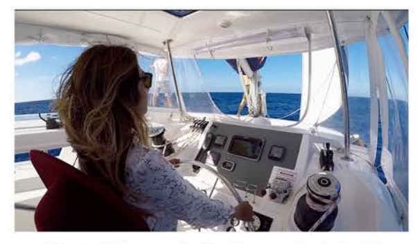
EP 4 | French Polynesia | 7:25