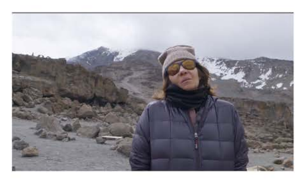
EP 9 | Kilimanjaro | 8:00