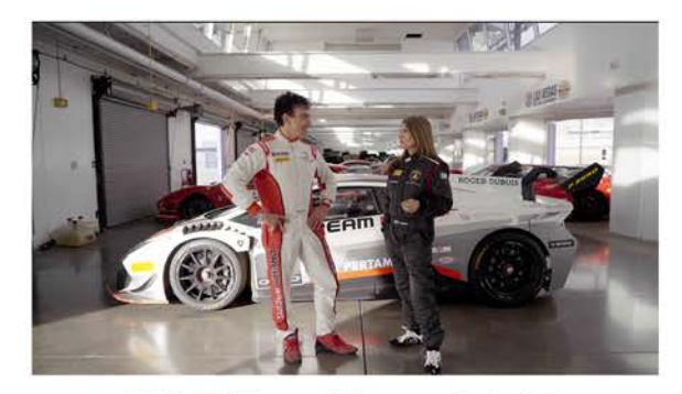
EP 7 | Las Vegas | 4:37